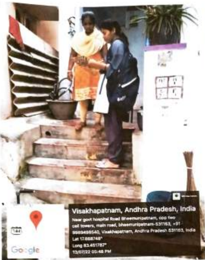
Visakhapatnam, Andhra Pradesh, India Near govt hospital Road Bheemunipatnam, opp two cell towers, main road, bheemunipatnam-531163, +91-9989498540, Visakhapatnam, Andhra Pradesh 531163, India Lat 17.888748° Long 83.451787° 13/07/22 05:48 PM