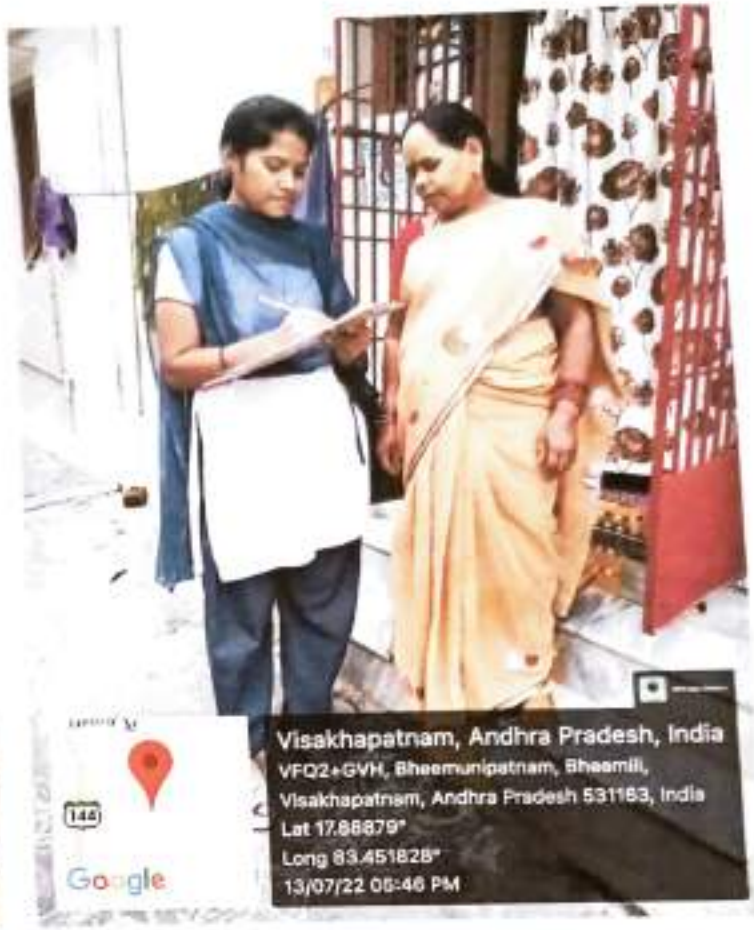
Visakhapatnam, Andhra Pradesh, India VFQ2+GVH, Bheemunipatnam, Bheemili, Visakhapatnam, Andhra Pradesh 531163, India Lat 17.88879° Long 83.451828° 13/07/22 05:46 PM