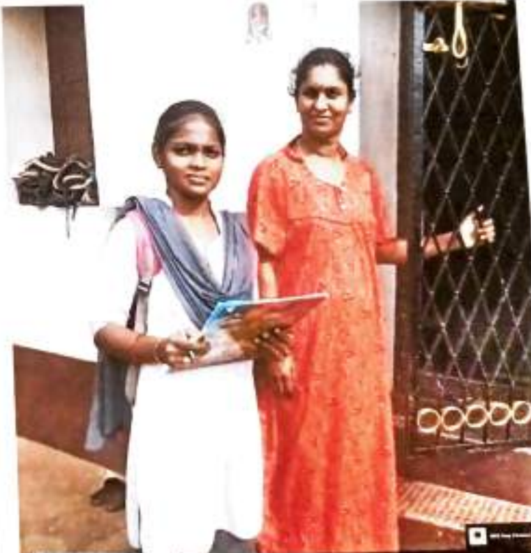
Visakhapatnam, Andhra Pradesh, India Bheemunipatnam Narsipatnam Rd, Visakhapatnam, Andhra Pradesh 531163, India Lat 17.892347° Long 83.427302° 22/08/22 03:46 PM