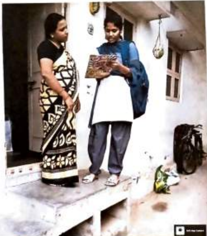
Visakhapatnam, Andhra Pradesh, India VFQ2+7QB, Main Road, Bheemunipatnam, Bheemili, Visakhapatnam, Andhra Pradesh 531163, India Lat 17.888442° Long 83.451814° 13/07/22 05:51 PM